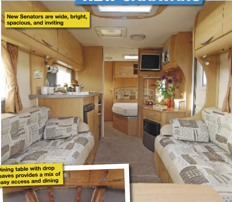
Dining table with drop leaves provides a mix of easy access and dining