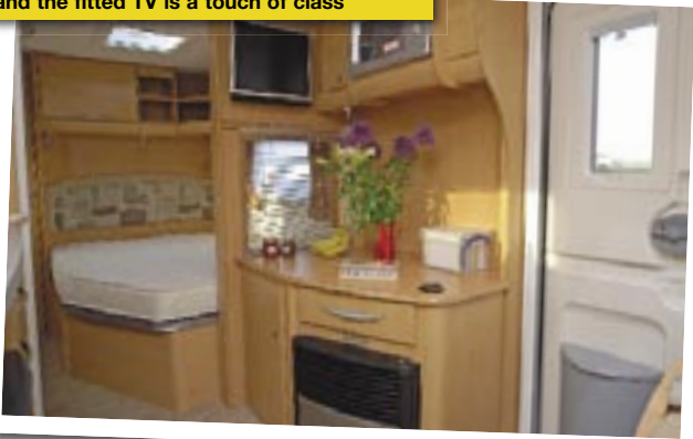
Low sideboard adds to spacious ambience, and the fitted TV is a touch of class