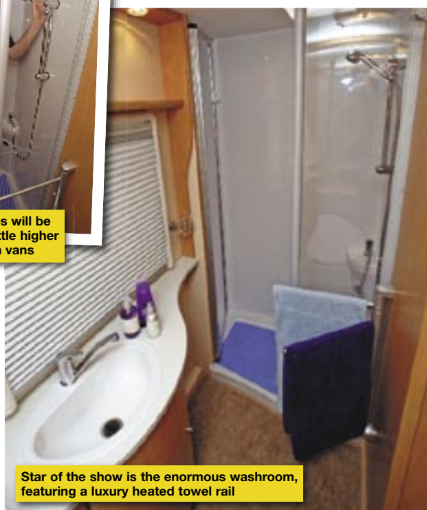
Star of the show is the enormous washroom, featuring a luxury heated towel rail