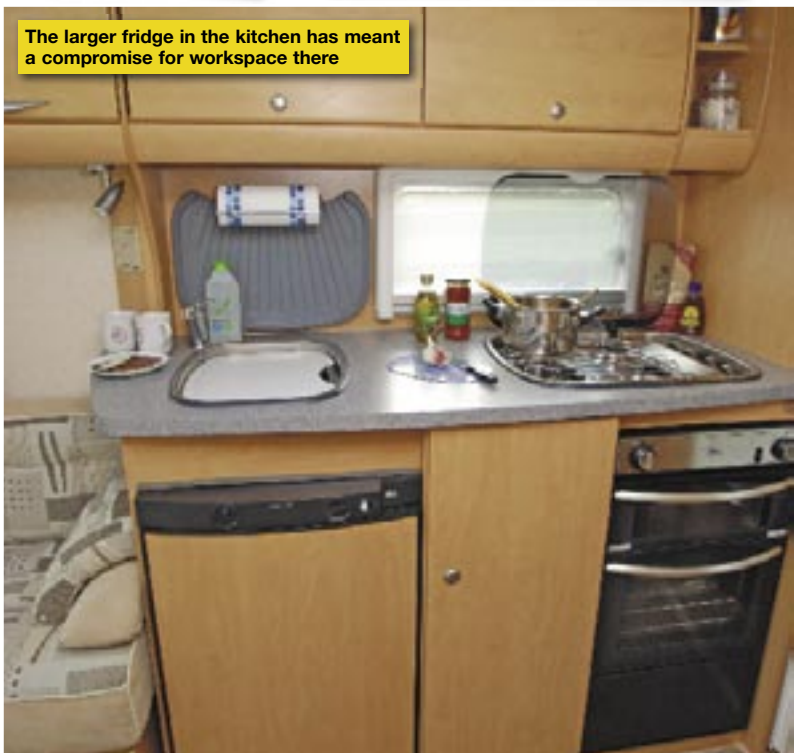
The larger fridge in the kitchen has meant a compromise for workspace there