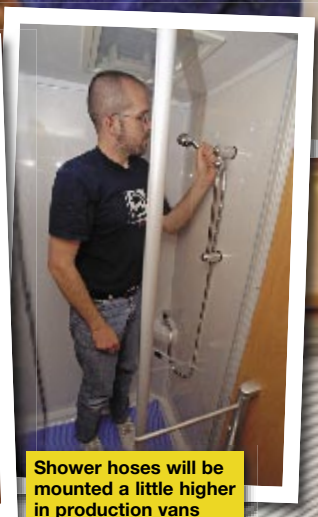
Shower hoses will be mounted a little higher in production vans