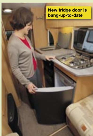
New fridge door is bang-up-to-date