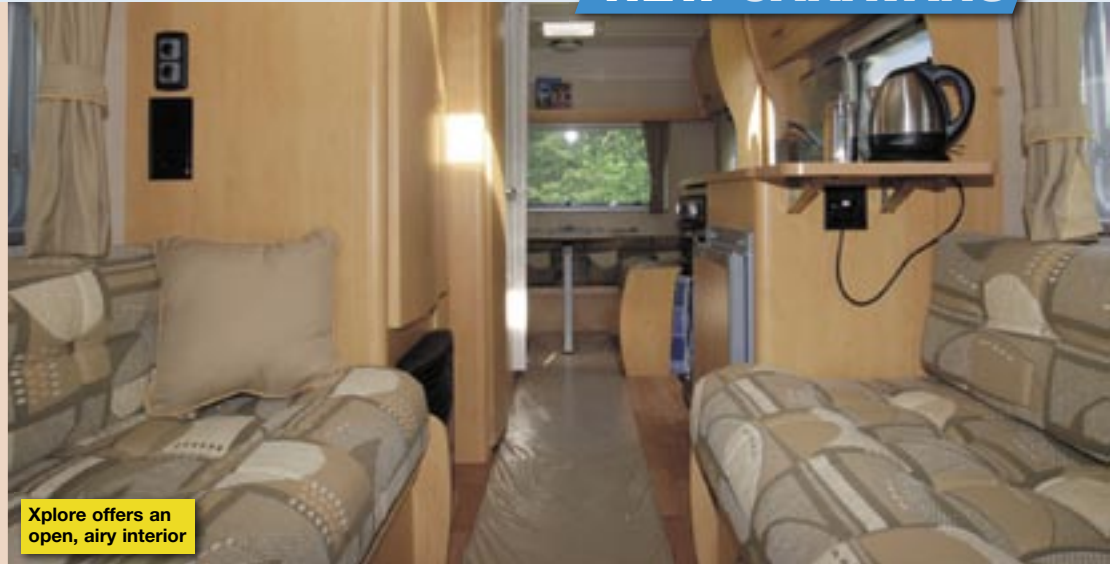
Xplore offers an open, airy interior