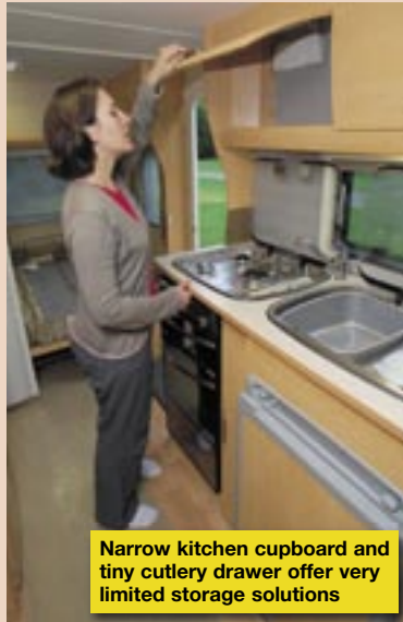
Narrow kitchen cupboard and tiny cutlery drawer offer very limited storage solutions