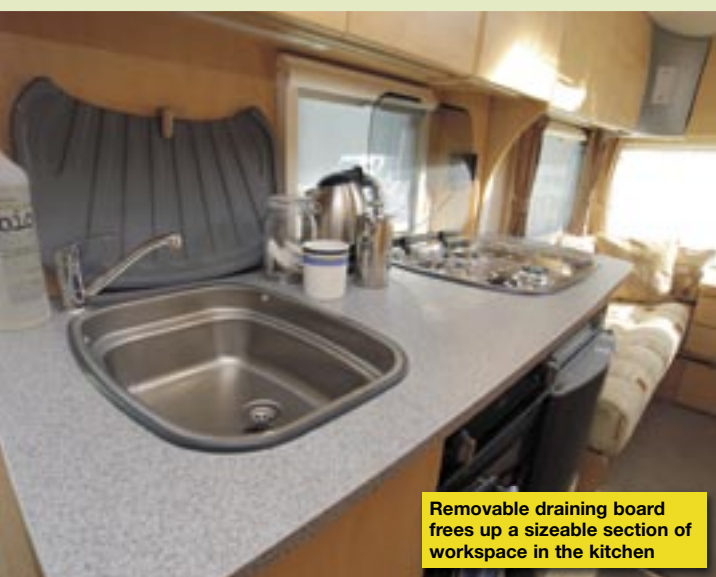
Removable draining board frees up a sizeable section of workspace in the kitchen