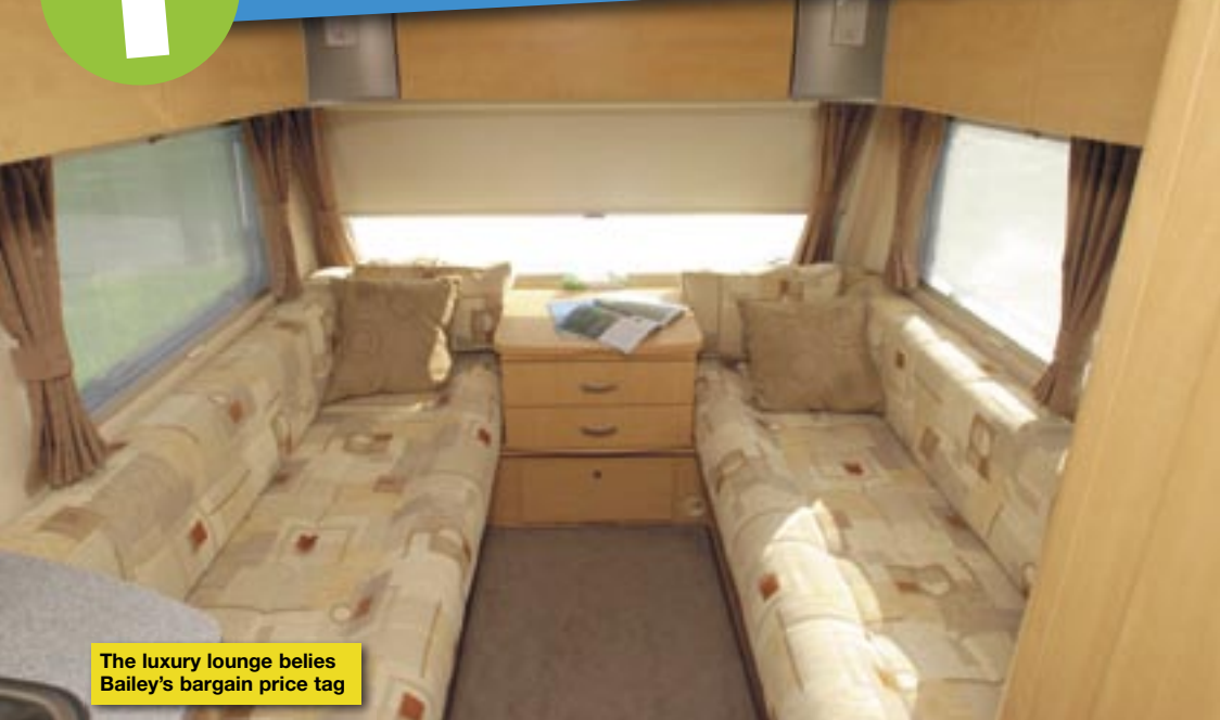
The luxury lounge belies Bailey's bargain price tag