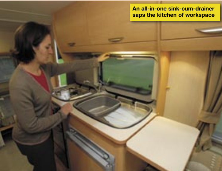
An all-in-one sink-cum-drainer saps the kitchen of workspace