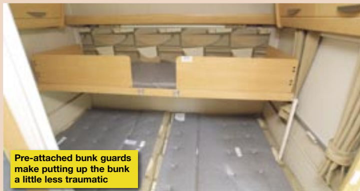
Pre-attached bunk guards make putting up the bunk a little less traumatic