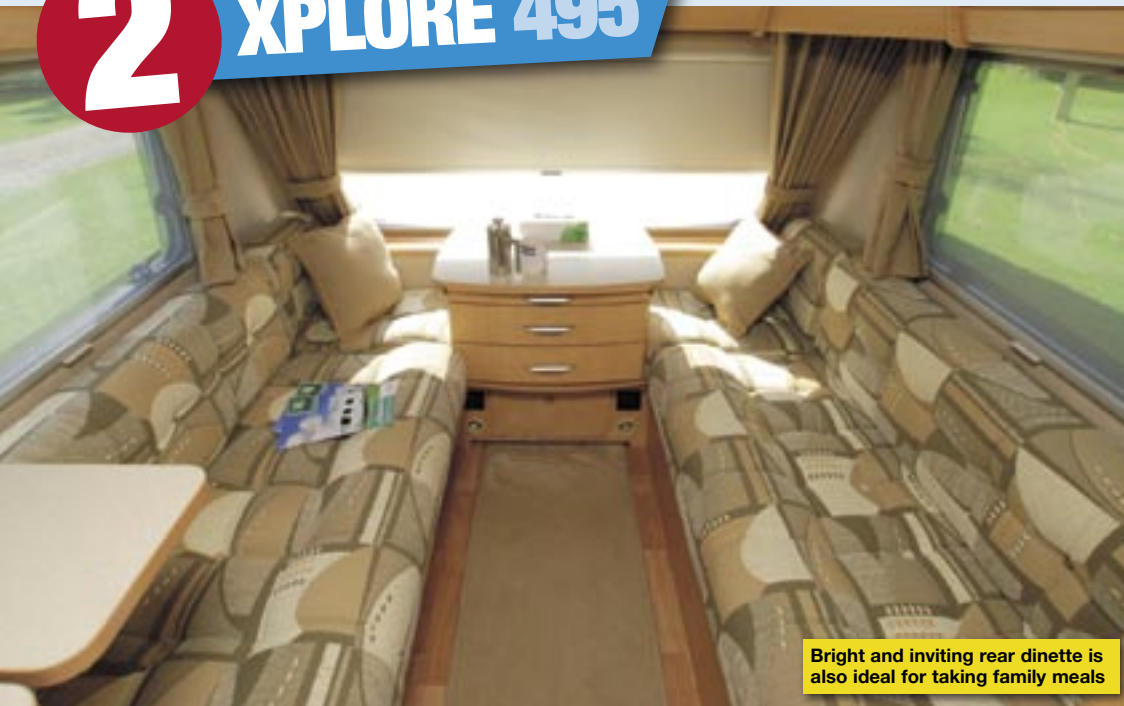
Bright and inviting rear dinette is also ideal for taking family meals