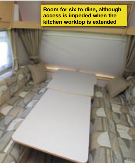
Room for six to dine, although access is impeded when the kitchen worktop is extended