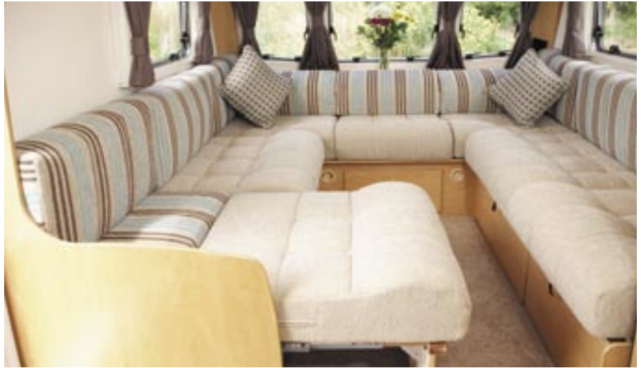
Seat bases can be moved forward so that you can put your feet up