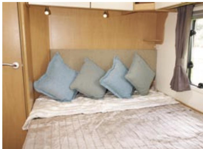
Those plain white walls make the bedroom look crisp and light