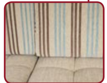
There are three choices of upholstery; this one is called Scorpio