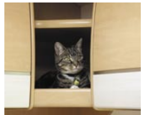
Tiger, the site owner's cat, leapt in to test the shelving

And yet more brilliance comes in the form of the 624's seat bases. Here, as in many wide-bodied tourers, putting your feet up on the opposite settee (shoes off, of course!)