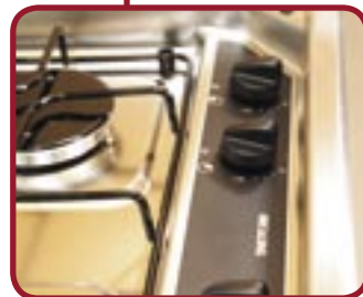
Cooking equipment is three burners plus the usual grill and oven