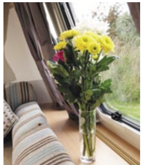
A deep shelf runs the width of the front

isn't easy. Bailey's answer is to provide four seat bases that pull out individually to make foot rests. Simple and superb. This same clever system allows the entire seat to be raised on gas-filled struts, meaning drop down flaps and shifting seat cushions to get to the void below is now a thing of a previous caravanning age.