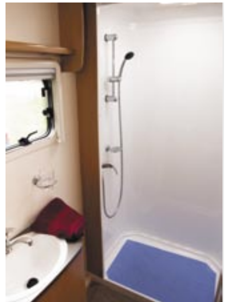
The shower is large and rectangular

Finally, the full-width washroom boasts a shower nearly a metre wide, and a top-spec Thetford loo with so much space around it that reading a broad sheet newspaper is a cinch. Again the plain plastic walls (sounds horrid but it's not) keep this space bright and we liked the high but unusual rear window. ■