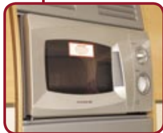
The microwave oven gets a proper housing that's colour-toned