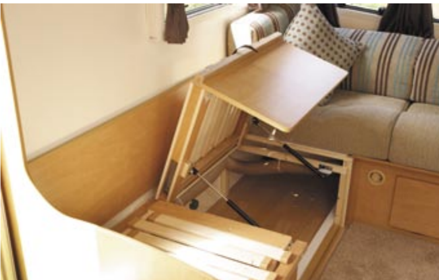
More brilliance comes in the shape of the seat bases - they raise on gas-filled struts