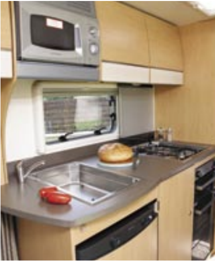
Large rectangular sink and ample work surface