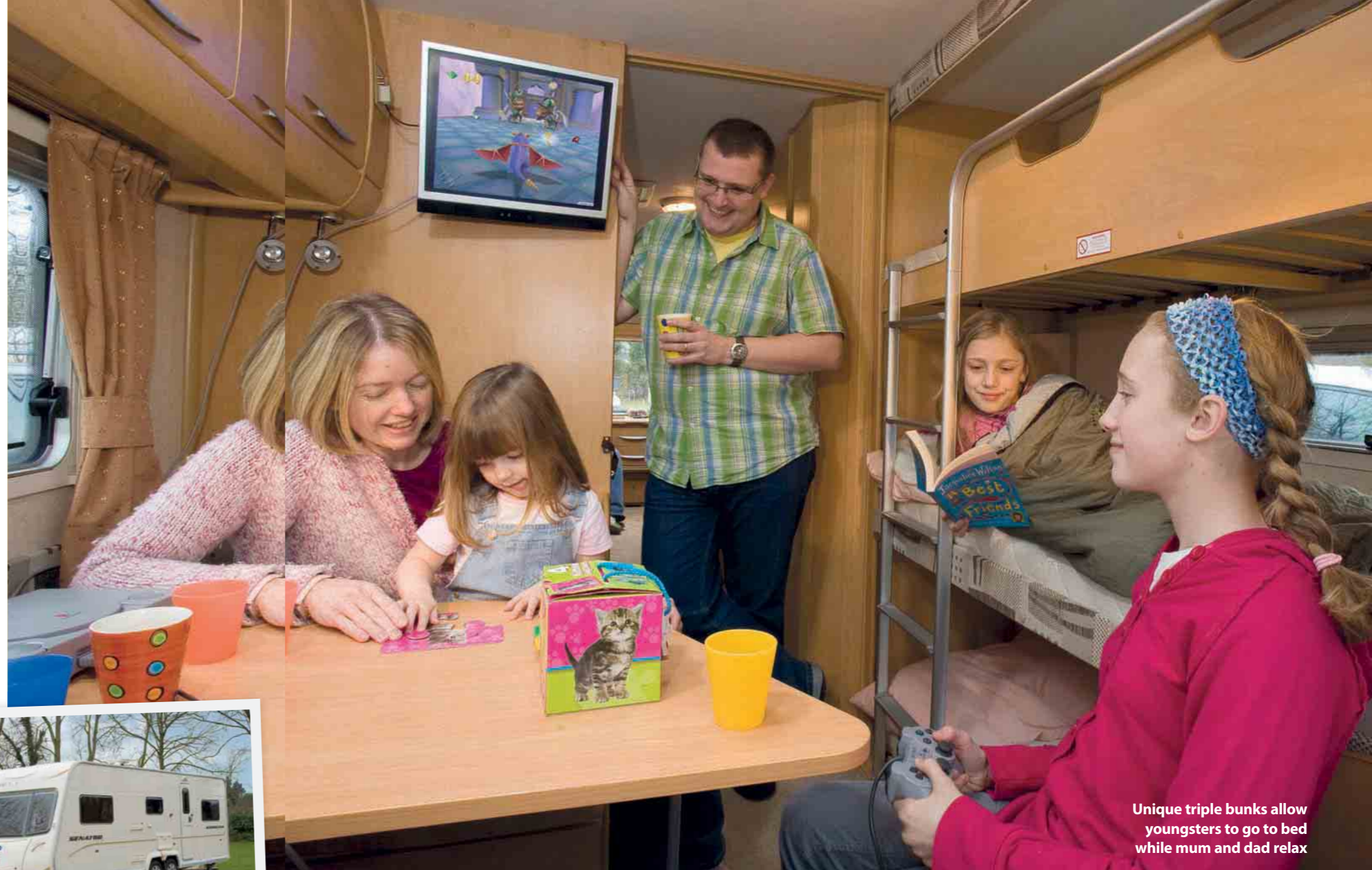
Unique triple bunks allow youngsters to go to bed while mum and dad relax