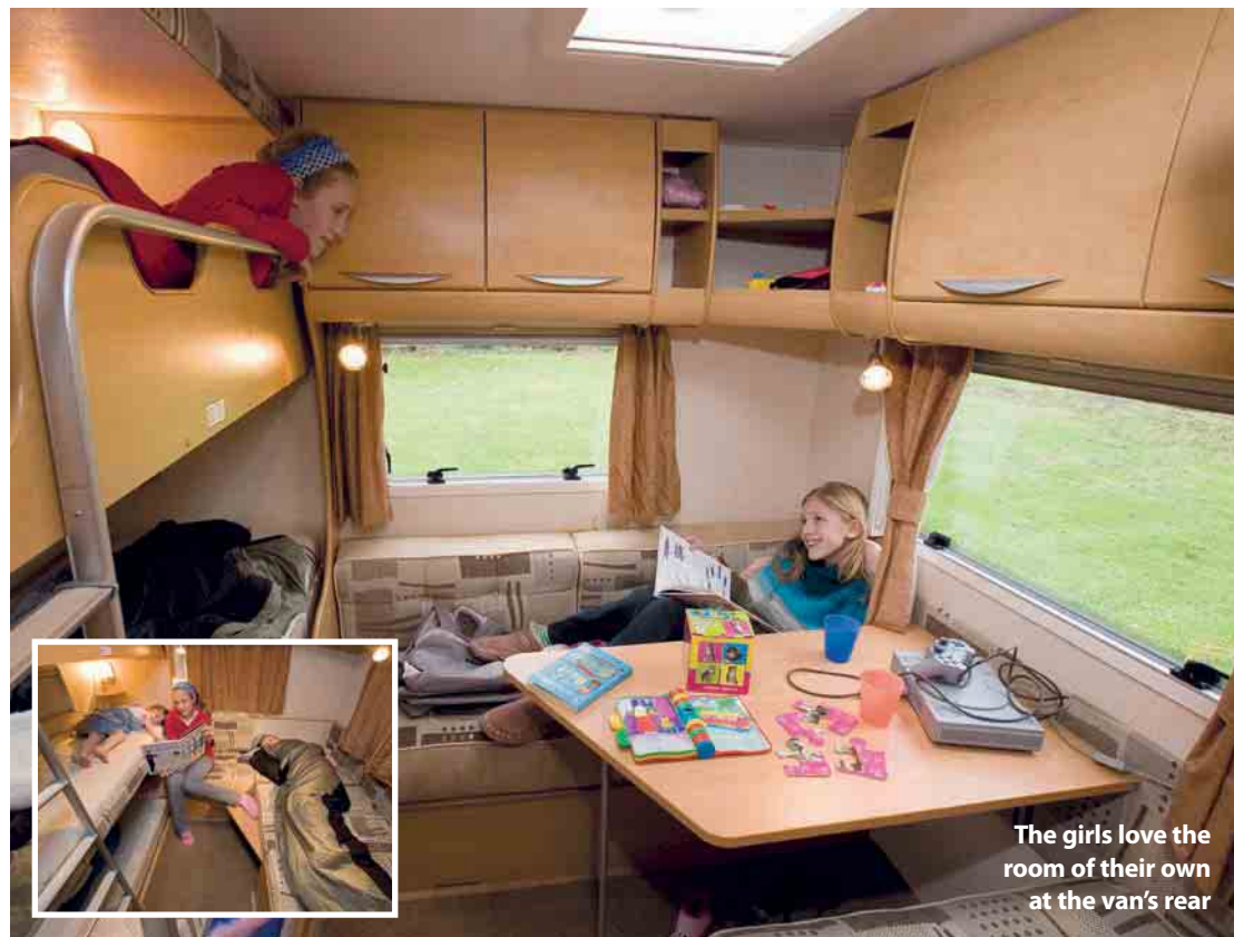
The girls love the room of their own at the van's rear