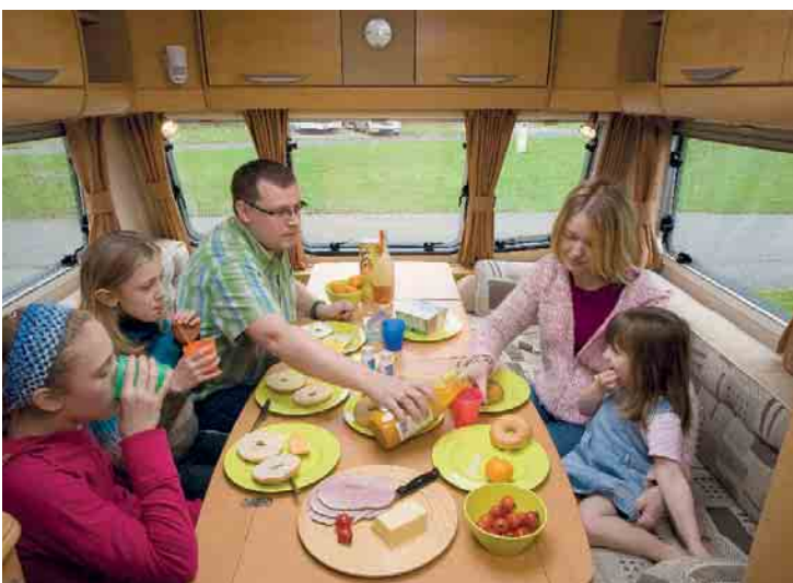
Room for one more: front dinette easily accommodates five for lunch

The site has all the usual club site facilities, including a pristine washblock. This, added to the welcoming wardens and verdant grounds, make Chertsey a delightful base for your holiday.