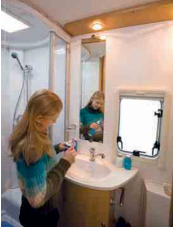
Luxury washroom has walk-in shower, but not enough storage

combined cutlery drawer. The freestanding table stows beside it, freeing up space elsewhere."