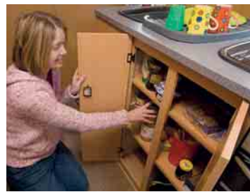
Plenty of food storage space in the large undersink cupboard

alongside and the new swivel-bowl Thetford C250 toilet. This has a higher seat and the cassette is on wheels, making it easier to drag to an emptying point.