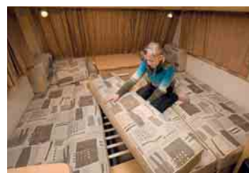
Assembling the double bed is a cinch, it's big and comfy, too