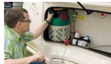
ABOVE Locker is easily accessed BELOW Exterior socket for awning

At first sight this twin-axle giant is impressive. We love the glinting alloy wheels, fuss-free decals and trademark Bailey body shape. Its square front divides opinion, but