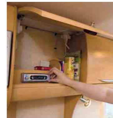
ABOVE Top-notch stereo also plays DVDs LEFT Excellent storage in under-sofa wire drawer. Cushions are supportive