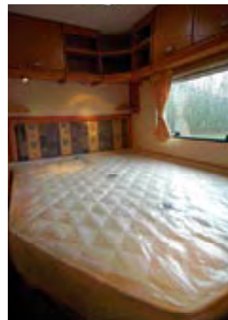
Fixed double is fine for six-footers.