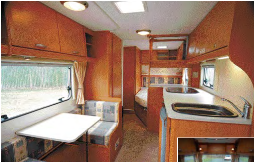
Superb kitchen and huge front lounge (inset) mean catering for six is feasible.

be a tight squeeze, but with two smallish kids in the side dinette, there's ample room to accommodate a brace of larger children on the two front sofas, without going to the trouble of making up the mammoth double bed by extending the pull-out slats between the two sofas.