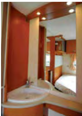
Sink and vanity unit are in bedroom.

BAILEY OF BRISTOL South Liberty Lane, Bristol BS3 2SS Tel: 0117 966 5967 Web: www.bailey-caravans.co.uk