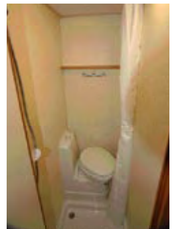
Washroom is small and pretty basic.

And finally, if you're beginning to think this 'goldilocks' combination is just too good to be true and the hidden drawback is a hefty pricetag, think again. The Ranger 620/6 will retail at just £11,595 plus delivery. ■